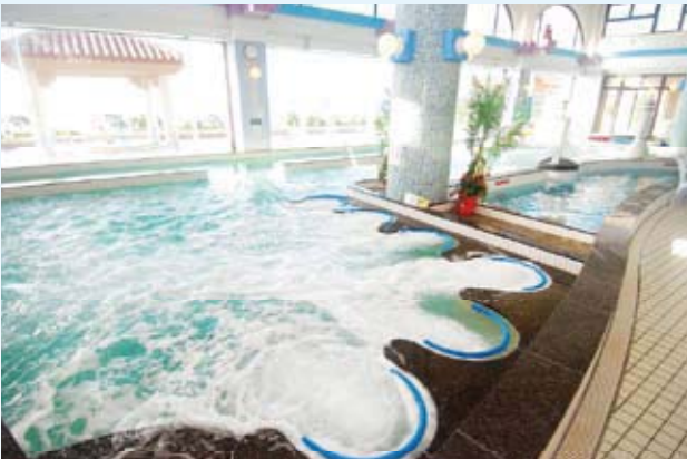
Floatation massage tub