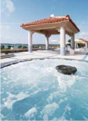
Outdoor jet bath