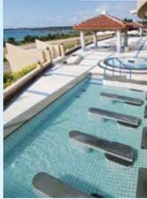
Outdoor silky bath